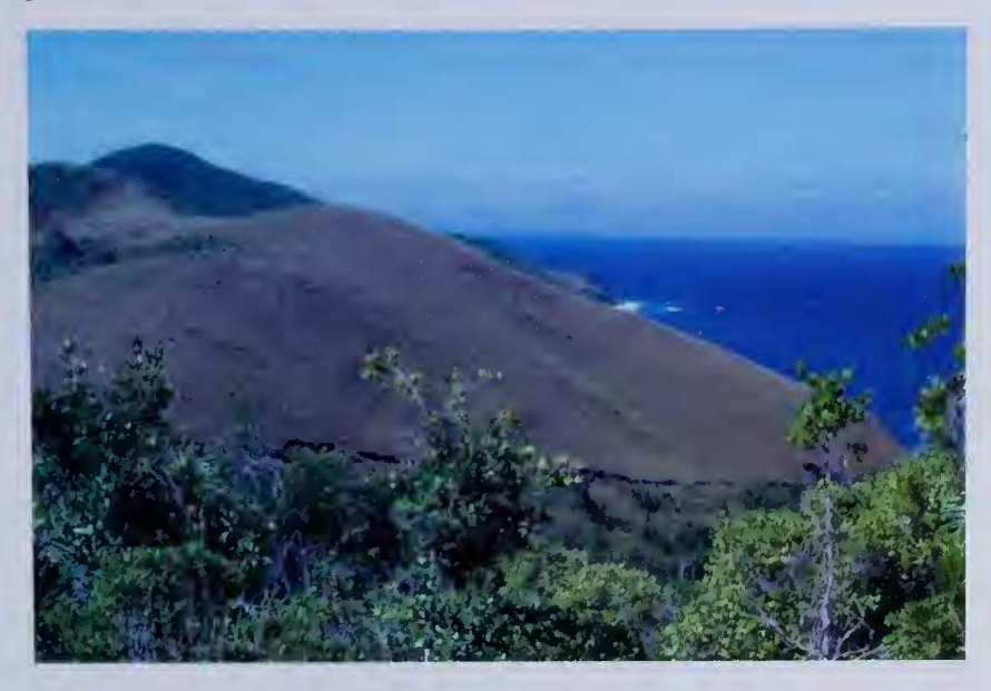
Figure 6 Grassland of Alang alang south of Camp 2.